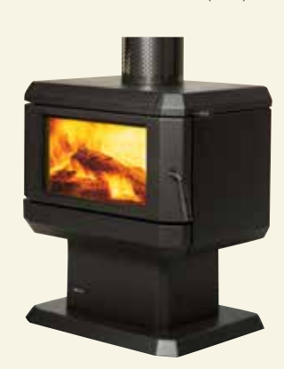
Above: Albany wood fire (F200B-1)